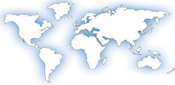
Emerged surface in Earth